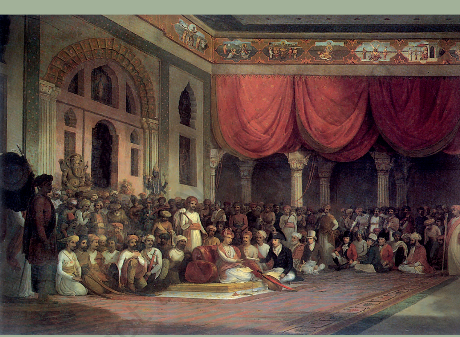
The British Resident at the court of Poona concluding a treaty, 1790